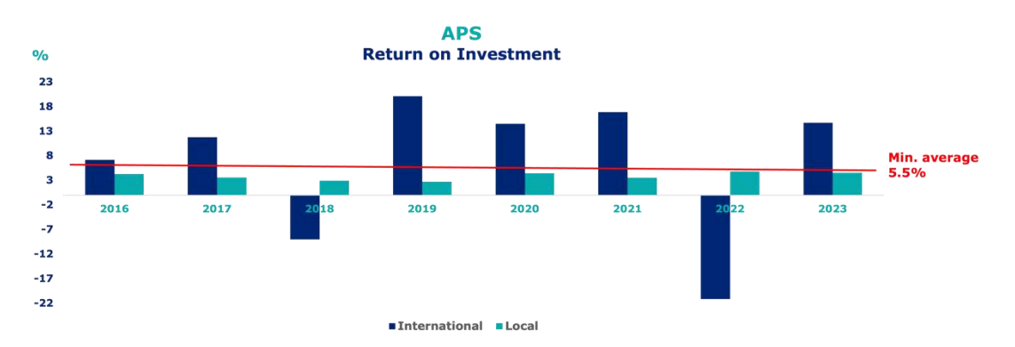
Figure 2: Returns on the local and international investments